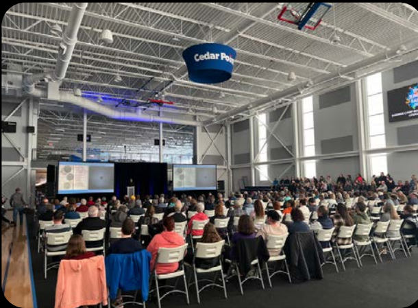
When Day Becomes Dusk Presentation at Cedar Point Sports Center - April 3rd