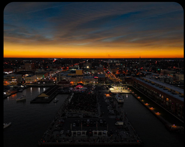
Totality over SUNdusky

Sandusky was lucky to have beautiful weather and sunshine for the event - clear skies and a great line of sight for the big show on the 8th.