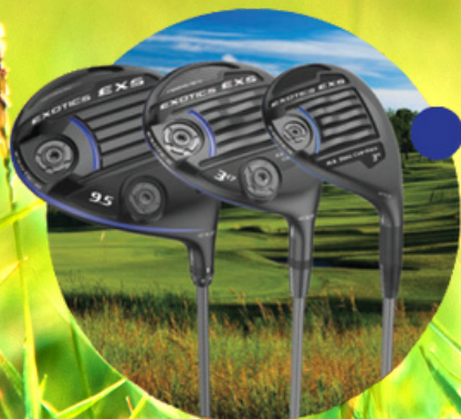
Touredge EXS Driver, 5 Wood, and 3 Wood